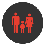
Understanding Responsible Fatherhood