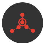
Developing Effective Fatherhood Programs