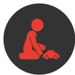
Realities of Child Support for African Americans and Latinos Environments