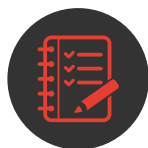
Assessing Friendly Fatherhood Environments