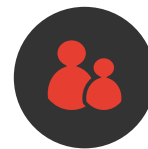
The Impact of Fatherlessness on Urban Communities of Color