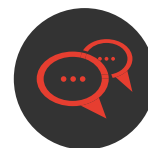
The Communication Gap of Motherhood and Fatherhood